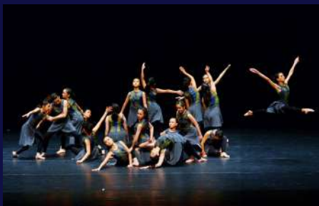
The 53rd Hong Kong Schools Dance Festival Modern Dance - Honours & Choreography Awards