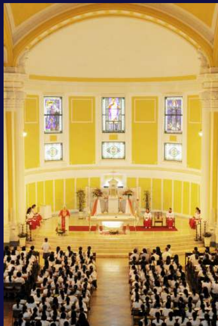
Celebrating the Eucharist

本校已於二〇〇四年九月起轉制，由過往的補助學校，轉為直接資助學校。此項轉變使本校在辦學方面獲更大的靈活性，充分發揮其辦學理念及使命，以繼續發展聖保祿學校備受本地及國際著名學府認可的卓越全人教育。這種鍥而不舍追求高效能及卓越的信念，有助學校提高教育質素，達至世界級水平，並在二十一世紀堅定不移。