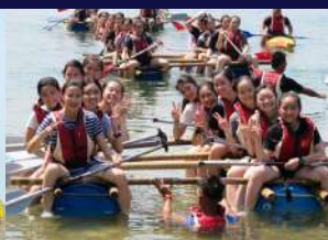
Leadership Training Camp