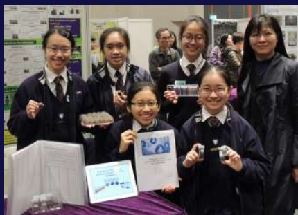
Hong Kong Chemistry Olympiad Champion