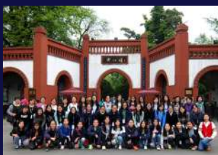
Sichuan Service Tour