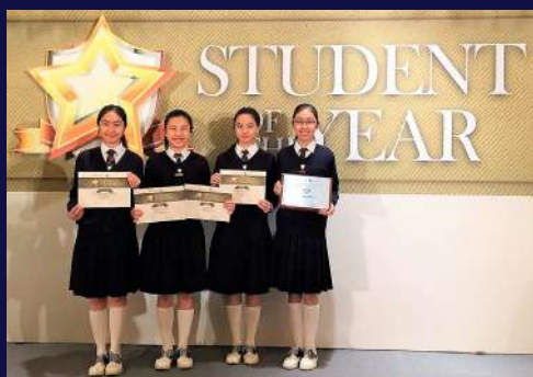
SCMP Student of the Year Awards 2016 -2017