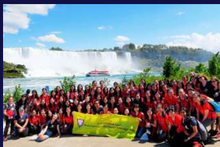
Brescia Girls LEAD Leadership Training Programme 2017