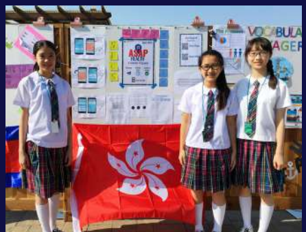
Technovation Challenge Hong Kong 2017 First Prize (Senior Team)

聖保祿學校作為「資訊科技卓越中心」，致力推廣在教與學中應用移動學習及資訊科技。本校支援學生網上學習，並引入嶄新的校本電子書研發項目，激發學生創意思維、提升批判性思考能力、媒體欣賞及創作能力。成為政府資訊科技總監辦公室選為合作夥伴學校之一，學校獲得港幣500萬元的資金，以便於2015/16至2022/23學年間提供資訊科技增潤培訓予我們的中二至中六學生，這將助長整體資訊科技氣氛、激發對資訊科技的興趣和於校園社區中發掘資訊科技人才。