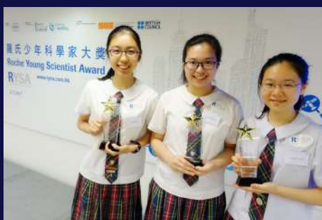
Roche Young Scientist Award 2017 Champion Trip to Switzerland

學校貫徹以營造愉快、融洽和合作的校園文化為優先。在這氛圍下，培養學生高尚的品格、建立珍貴的友誼、發展多元潛能、進而啟動高效能的學習動機，主動地追求學業的成就及個人潛能的發展。在這正面積極的氣氛薰陶下，使學生能在嚴謹而充滿挑戰的學習課程中，奮力追求卓越。為更妥善裝備學生多元發展的途徑，本校已註冊成為英國商業及科技教育委員會(BTEC)中心，給學生提供多元化的升學及擇業機會。