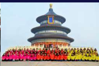
Beijing Tsinghua University Putonghua Immersion Course