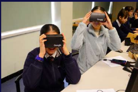
Experiencing the Virtual Space via AR & VR