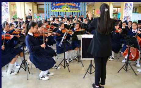
Joint School Music Competition 2017 Champion