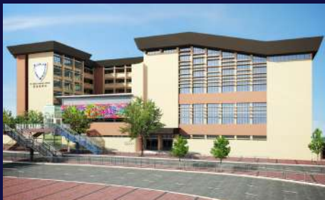
Newly built green building, the Smart Oasis

聖保祿學校是以「學習為本」，在一個持續學習的世界中，邁向一個學習的新紀元。其價值取向就是誠信、喜悅、樸實、勤奮及卓越。