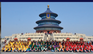
Beijing Language and Culture University Putonghua Immersion Course