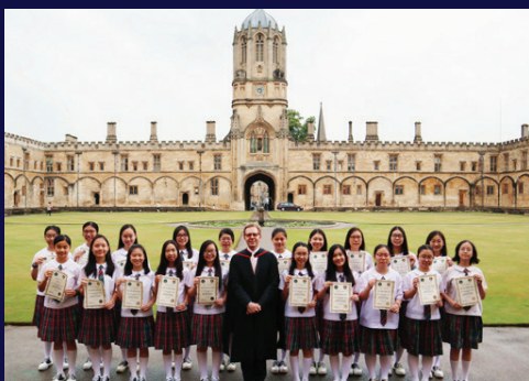
Oxford STEM and Entrepreneurship Tour