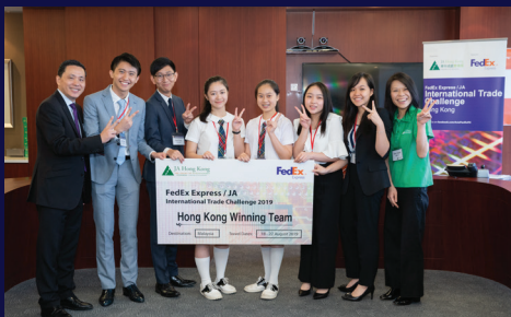
International Trade Challenge Champion