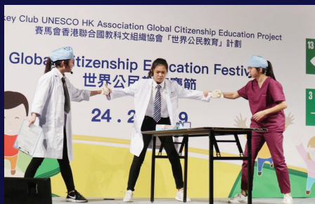
UNESCO HK Global Citizenship Education Project Script Writing and Drama Competition Champion