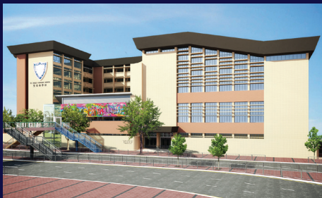
Newly built green building, the Smart Oasis

聖保祿學校是以「學習為本」，在一個持續學習的世界中，邁向一個學習的新紀元。其價值取向就是誠信、喜悅、樸實、勤奮及卓越。