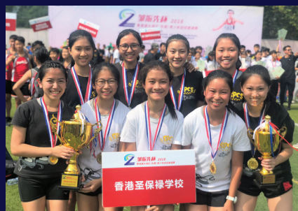
Greater Bay Area Zou Zhenxian Cup (Dongguan) Youth Athletics Invitation Tournament