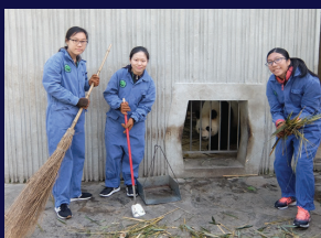
Sichuan and Wolong Panda Research Base service Tour