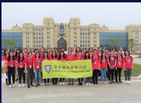
Fuzhou VR Experiential Tour