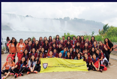
Brescia Girls LEAD Leadership Training Programme

學校貫徹以營造愉快、融洽和合作的校園文化為優先。在這氛圍下，培養學生高尚的品格、建立珍貴的友誼、發展多元潛能、進而啟動高效能的學習動機，主動地追求學業的成就及個人潛能的發展。在這正面積極的氣氛薰陶下，使學生能在嚴謹而充滿挑戰的學習課程中，奮力追求卓越。為更妥善裝備學生多元發展的途徑，本校已註冊成為英國商業及科技教育委員會(BTEC)中心，給學生提供多元化的升學及擇業機會。