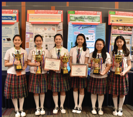
Hong Kong Youth Science and Technology Innovation Competition 1 st Class Awards