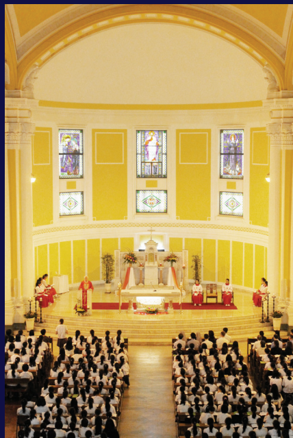
Celebrating the Eucharist

本校已於二〇〇四年九月起轉制，由過往的補助學校，轉為直接資助學校。此項轉變使本校在辦學方面獲更大的靈活性，充分發揮其辦學理念及使命，以繼續發展聖保祿學校備受本地及國際著名學府認可的卓越全人教育。這種鍥而不捨追求高效能及卓越的信念，有助學校提高教育質素，達至世界級水平，並在二十一世紀堅定不移。