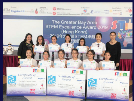
The Greater Bay Area STEM Excellence Award Best STEM School

聖保祿學校作為「資訊科技卓越中心」，致力推廣在教與學中應用移動學習及資訊科技。本校支援學生網上學習，並引入嶄新的校本電子書研發項目，激發學生創意思維、提升批判性思考能力、媒體欣賞及創作能力。成為政府資訊科技總監辦公室選為合作夥伴學校之一，學校獲得港幣500萬元的資金，以便於2015/16至2022/23學年間提供資訊科技增潤培訓予我們的中二至中六學生，這將助長整體資訊科技氣氛、激發對資訊科技的興趣和於校園社區中發掘資訊科技人才。