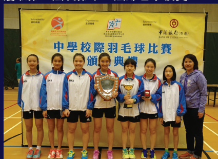
The Inter-School Badminton Competition Champion