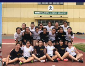
Fukuoka Athletic Team Training