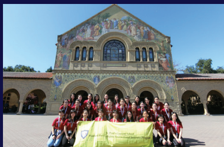
Stanford University Pre-Collegiate International Program