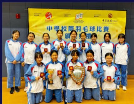
The Inter-School Badminton Competition Division One (Hong Kong) Champion

學校貫徹以營造愉快、融洽和團結的校園作為重要發展方向。在這氛圍下，能培養學生高尚的品格、建立珍貴的友誼、發展多元潛能、進而提升學習動機，主動地追求學業成就及個人潛能的發展。在正面積極氣氛的薰陶下，學生能在嚴謹而充滿挑戰的學習課程中，奮力追求卓越。為了進一步使學生擁有多元發展的途徑，本校已註冊成為英國商業及科技教育委員會 (BTEC) 中心，給學生提供多元化的升學及擇業機會。