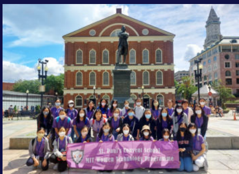
MIT Women's Technology Program