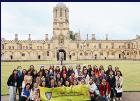
Oxford STEM and Entrepreneurship Tour