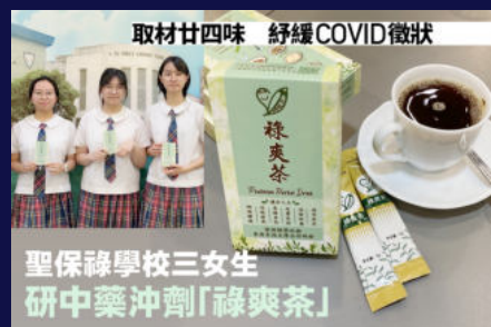
Paulinian Herbal Drink patented in China 本校與香港科技大學共同研發「祿爽茶」

聖保祿學校作為「資訊科技卓越中心」，致力推廣在教與學中應用資訊科技。本校支援學生網上學習，並引入嶄新的校本電子書研發項目，激發學生的創意思維和提升批判性思考能力、媒體欣賞及創作能力。本校成為政府資訊科技總監辦公室的合作夥伴學校之一，已於2015/16至2022/23學年間獲得港幣500萬元的資金，為中二至中六的學生提供資訊科技增潤培訓課程。該課程大大提升了本校使用資訊科技的氣氛、激發學生對資訊科技的興趣和在校園及社區中發掘資訊科技人才。