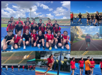
Athletics Team Taichung Training Tour