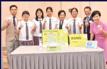
第24屆消費文化考察報告獎 - 「可持續消費創意設計」主題 冠軍