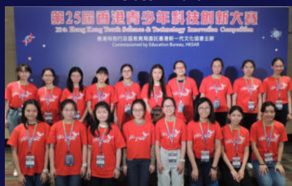
25th Hong Kong Youth Science & Technology Innovation Competition Champion