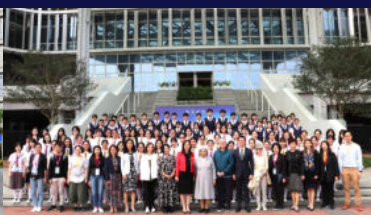
Citizenship and Social Development Mainland Study Tour to Minxin HK School (GZ)