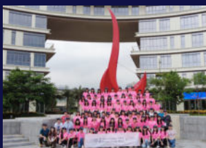
HKUST (Guangzhou) AI Summer Camp