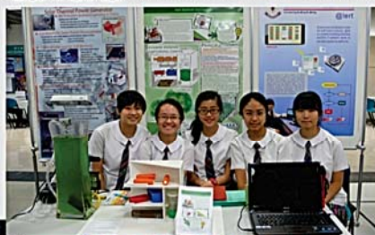
Young Professionals Exhibition & Competition