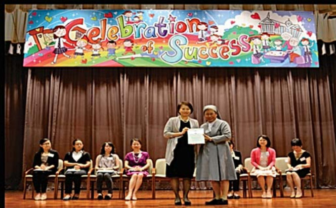
Celebration of Success

學校貫徹以營造一個愉快融洽合作的校園文化為優先。在這氛圍下，培養學生高尚的品格、建立珍貴的友誼、發展多元潛能、進而啟動高效能的學習動機，主動地追求學業的成就及個人潛能的發展。在這正面積極的氣氛薰陶下，使學生能在嚴謹而充滿挑戰學習課程中，奮力追求卓越。