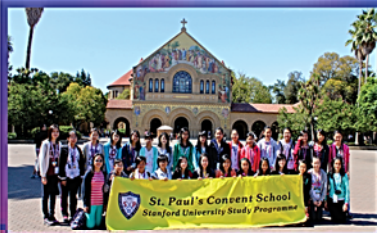
Stanford International Youth Camp