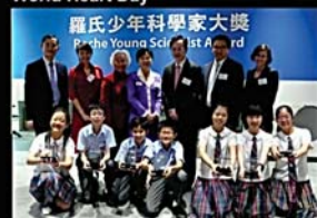
Roche Young Scientist Award