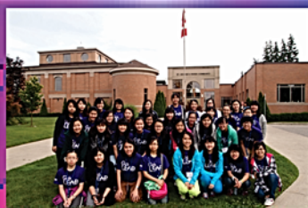
Leadership Camp at Brescia, The University of Western Ontario