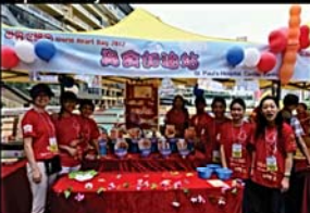
World Heart Day