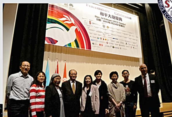
Peace Celebration, UNESCO