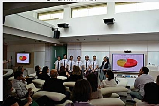
Hospitality Team and visitors from Brazil