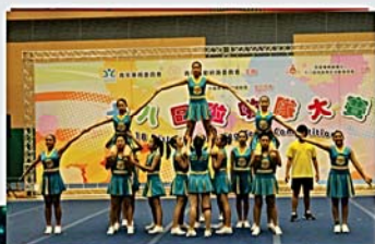
The 18 District Cheerleading Competition

Being a Centre of Excellence for IT in Education for over ten years, the school promotes mobile learning and IT across the curriculum. It supports e-learning opportunities and initiates a new school-based e-Book Development Project that stimulates creativity, critical thinking, media appreciation and production. To better equip our students for further studies and job opportunities, students can participate in Applied Learning Programme on topics such as Film and Video Production. Furthermore, students may also take IAL - AS/AL in place of HKDSE in secondary 5 and 6.