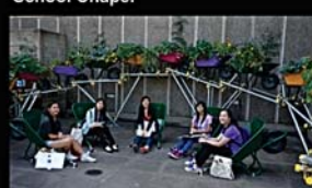
University of Arts London - International Summer School