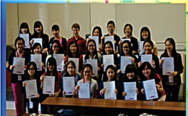
Stem World Tour Imperial College London UK