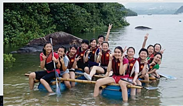
Leadership Training Camp