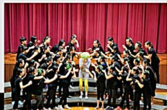
64th HK Schools Speech Festival Choral Speaking Champion