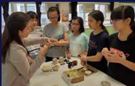
Lingzhi Cultivation Programme

聖保祿學校作為「資訊科技卓越中心」，致力推廣在教與學中應用移動學習及資訊科技。本校支援學生網上學習，並引入嶄新的校本電子書研發項目，激發學生創意思維、提升批判性思考能力、媒體欣賞及創作能力。成為政府資訊科技總監辦公室選為合作夥伴學校之一，學校獲得港幣500萬元的資金，以便於2015/16至2022/23學年間提供資訊科技增潤培訓予我們的中二至中六學生，這將助長整體資訊科技氣氛、激發對資訊科技的興趣和於校園社區中發掘資訊科技人才。