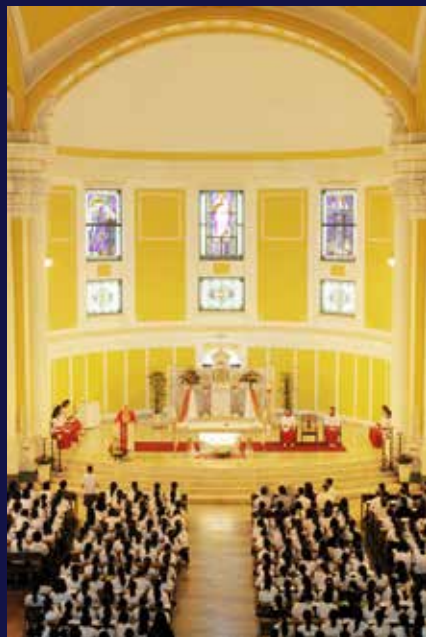
Celebrating the Eucharist

本校已於二〇〇四年九月起轉制，由過往的補助學校，轉為直接資助學校。此項轉變使本校在辦學方面獲更大的靈活性，充分發揮其辦學理念及使命，以繼續發展聖保祿學校備受本地及國際著名學府認可的卓越全人教育。這種鍥而不捨追求高效能及卓越的信念，有助學校提高教育質素，達至世界級水平，並在二十一世紀堅定不移。