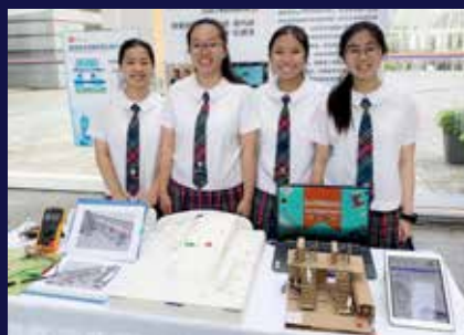
Greater Bay Area STEM Excellence Awards Gold Award