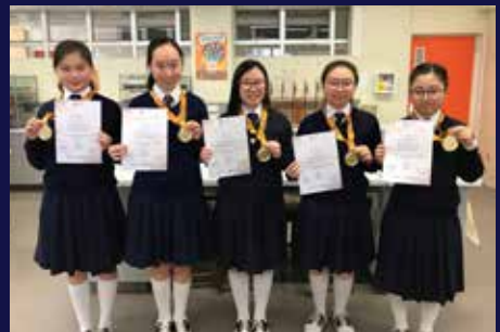
International Science and Invention Fair 2020 Gold Award