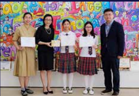
The Third Future Engineer Grand Challenge First Level Award

醫務化驗科學 Medical Laboratory Science Sports 體育運動