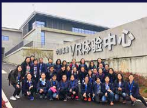
Fuzhou VR Experiential Tour