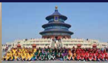
Beijing Language and Culture University Putonghua Immersion Course