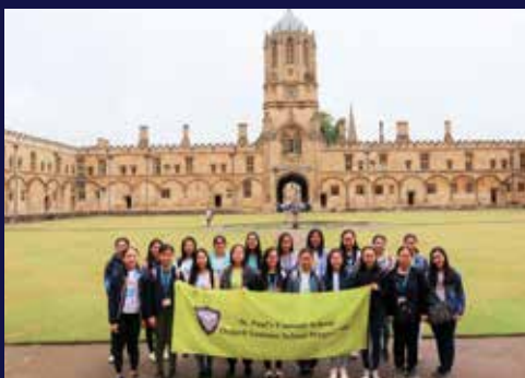
Oxford STEM and Entrepreneurship Tour