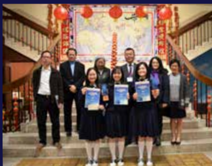
Qianhai Guangdong-Hong Kong-Macao-Taiwan Youth Innovation and Entrepreneurship Competition 2020 Champion