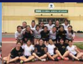
Fukuoka Athletics Team Training