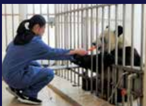
Sichuan and Wolong Panda Research Base Service Tour