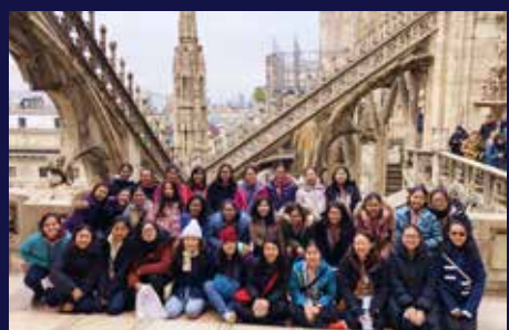
Europe Music Tour