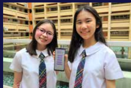
Innovate for Future Champion