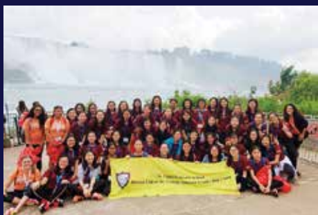
Brescia Girls LEAD Leadership Training Programme

學校貫徹以營造愉快、融洽和合作的校園文化為優先。在這氛圍下，培養學生高尚的品格、建立珍貴的友誼、發展多元潛能、進而啟動高效能的學習動機，主動地追求學業的成就及個人潛能的發展。在這正面積極的氣氛薰陶下，使學生能在嚴謹而充滿挑戰的學習課程中，奮力追求卓越。為更妥善裝備學生多元發展的途徑，本校已註冊成為英國商業及科技教育委員會(BTEC)中心，給學生提供多元化的升學及擇業機會。