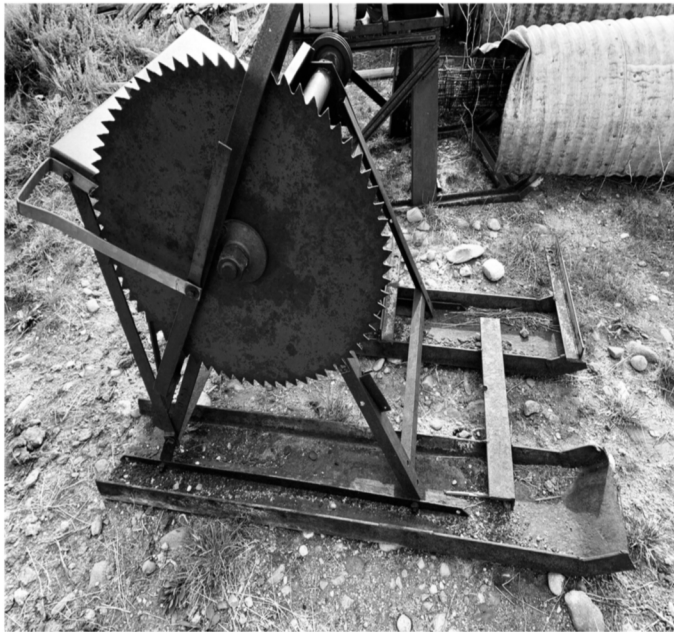
(Above) Buzz Saw- the 'murderer' at question